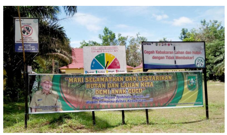
Figure 3. Fire prevention messages and FDRS boards in Desa Segati

The practice of Karhutla prevention in Riau is executed in two quarters, namely expert quarter with the formation of Karhutla Task Force. While in the technical quarter, the implementation involves the community as the spearhead of prevention of Karhutla in the fire prone-areas. Communication among stakeholders is performed through the Karhutla Task Force forum involving government, military, police and corporations. Other stakeholders such as corporations, researchers, mass media, NGOs and MPAs are less involved. The Karhutla Task Force in Riau is formed at the time of Emergency Karhutla in Emergency Condition, the status issued by the Governor after at least two districts / cities set the alert status. By 2017, the Riau Provincial Government established the Karhutla Emergency Standby from January 23 to April 27, 2017, then it extended again until 30 November 2017 in consideration of the potential dryness of the El Nino effect during the dry season within this period.