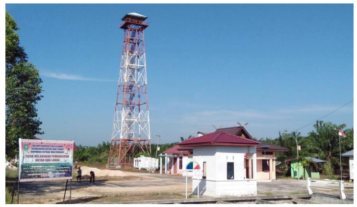
Figure 1. Integrated patrol post and fire monitoring tower in Desa Sepahat for coordination of fire prevention of MPA and stakeholders.

The risk reduction of rural communities of Karhutla in fire proneareas is done by the establishment of MPA. MPA designs the prevention activities of Karhutla through patrol and socialization to the community. Some MPAs already have institutional legality from the village and have built offices. For example MPA Sepahat Village was formed based on the Village Regulation Sepahat Bukit Batu District Bengkalis District No. 07 of 2009 on the Establishment of MPA. The MPA has a permanent office of corporate assistance with staff in charge of administration of the activities of its members. To improve the performance and institutional capacity of the MPA, they build communication networks with various stakeholders such as governments, NGOs, corporations, researchers and the media.