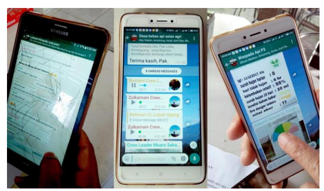
Figure 4. Communication activity in WAG

The use of the WhatsApp app as a formal communication channel is an interesting finding, as communication between stakeholders, especially government agencies, has penetrated bureaucratic barriers identical to traditional channels of communication, such as direct audiences or official letters. Stakeholders from government elements reveals that through WAG messages can be quickly received and responded by all group members. This condition is important to be considered in the standby condition of Karhutla so that fire prevention can be accomplished as early as possible to reduce the risk of Karhutla . Interestingly, the use of WAG is also performed to the community level because MPA also has a WAG for internal communication and WAG for communicating with other stakeholders.